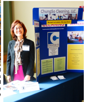
Over 25 certified minority- and women-owned businesses displayed at the North Central Indiana Business Conference held at Saint Mary's College March 12.