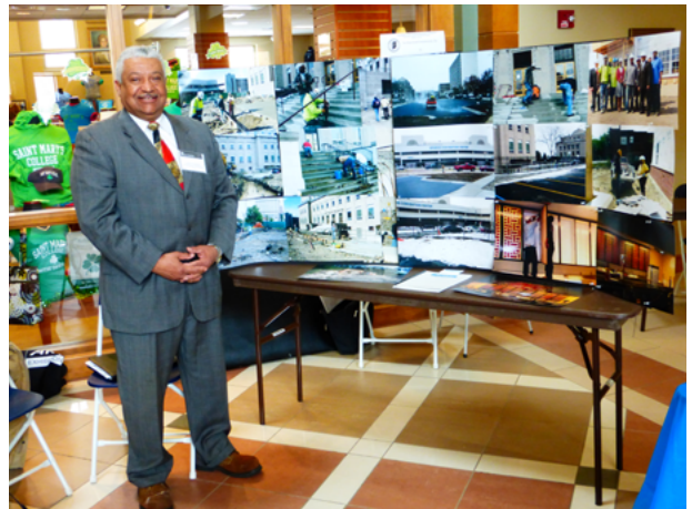
These companies had the opportunity to network with other certified businesses, procurement contacts and other buyers from the surrounding area.