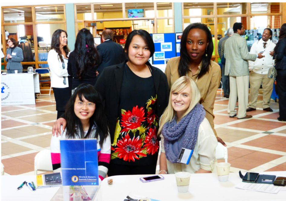
Thank you to the Saint Mary's College Student Volunteers who helped make the North Central Indiana Business Conference a success!