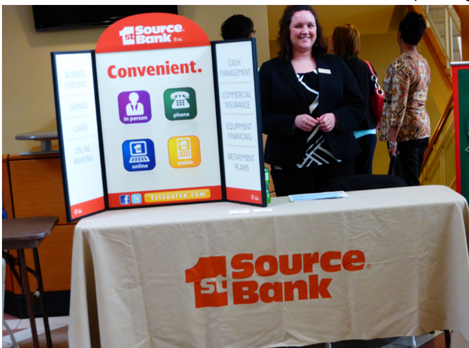
1st Source Bank was one of the sponsors of the North Central Indiana Business Conference.

The commission meeting schedule is on the website at http://www.in.gov/idoa/mwbe/2505.htm