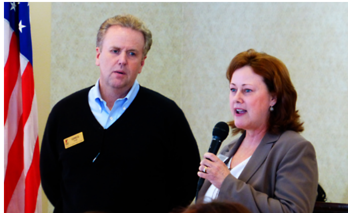
During the lunch session of the business conference, five companies had the opportunity to give a presentation to the attendees.

The North Central Indiana Business Conference was presented by the Indiana Minority and Women's Business Enterprises Division in conjunction with Saint Mary's College.